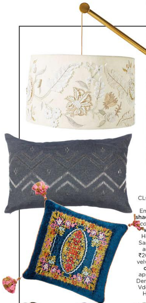
CLOCKWISE FROM TOP LEFT Embroidered lamp shade, anthropologie.com; embroidered wallpaper, UDC Homes; armchair, Sarita Handa; Floral and bees screen, ₹20,95,282 approx, velvet floral jacquard cushion, ₹75,411 approx, both Gucci; Denim pillow, ₹1,800, Vdo Le Home at The House of Things.